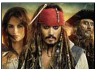
Movie Lists: Best, Worst, All-time Favorites. Pages 4-5