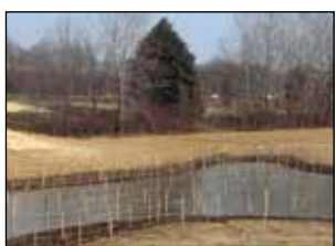
What's going on with the pond? Page 2