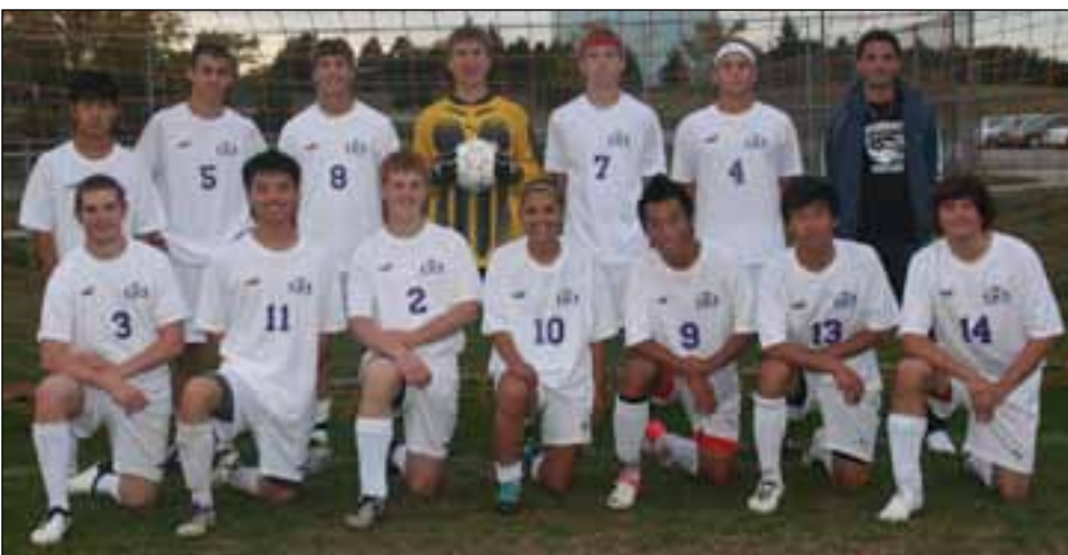
The soccer state championship is a first for the UW-Sheboygan team.