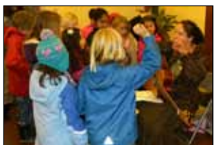
Children's Book Festival photos. Page 8