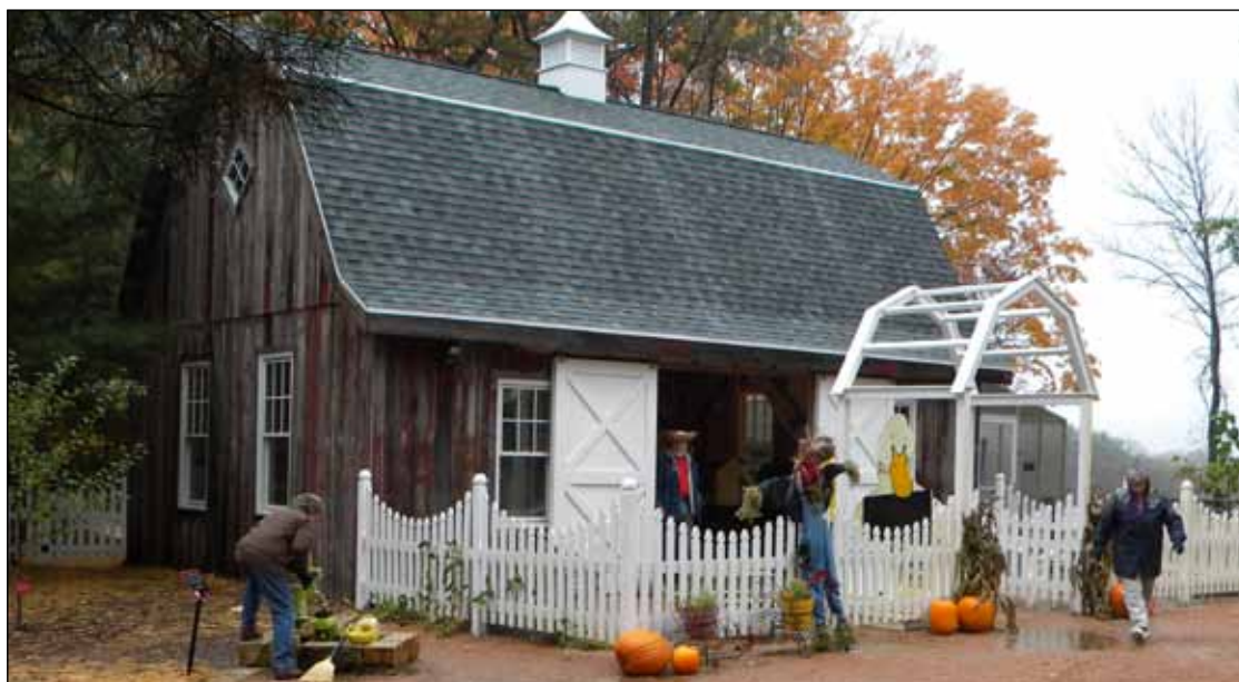
Preparations take place outside the barn at Bookworm Gardens on a rainy day. Activities inside include face painting and readings by the authors.