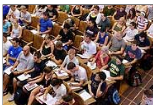
Transferring? More advice. Pages 4-5