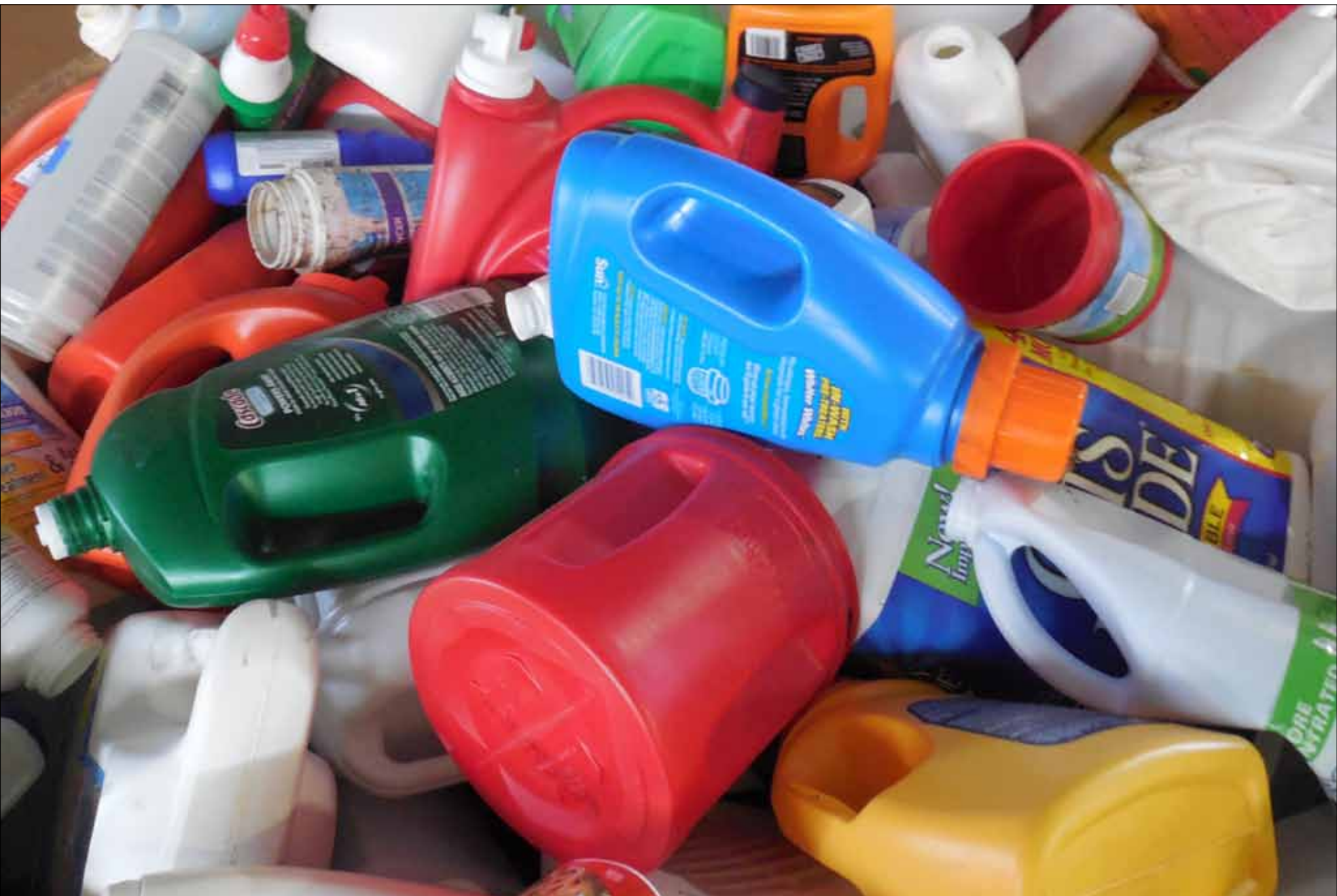
A variety of plastics await recycling in the Town of Cedarburg.