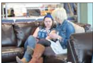
Better couches, new TV, and more. Page 2