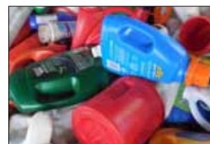
What happens to your plastic? Page 7