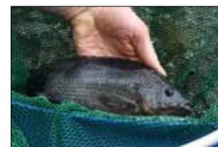
Aquaponics: Farms of the future. Page 8